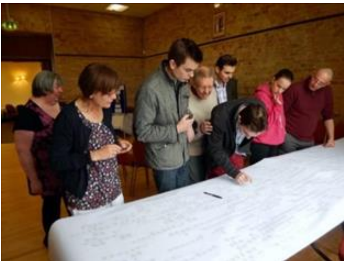
Exploring the family tree