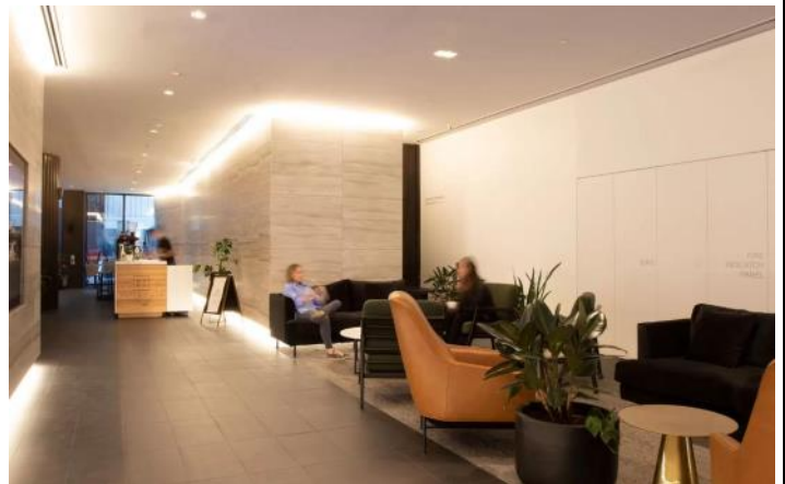
Foyer 10 Queen St