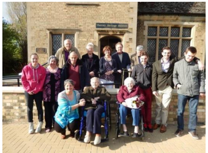
The 'Parker' family outside The Thorney Museum in the Tank Yard, Thorney