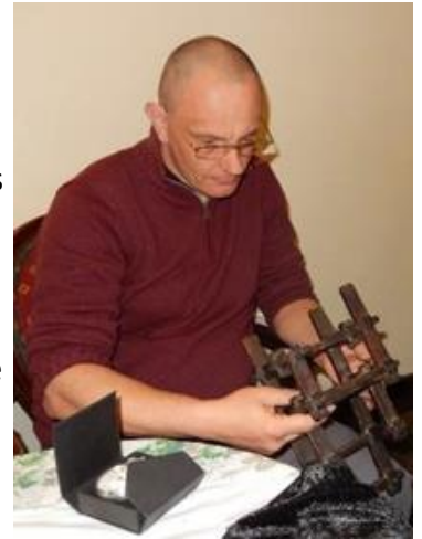
From one craftsman to another

I asked myself what would give me the courage to seek a publisher. Although I am an enthusiastic independent scholar, I do not have any qualifications in history or research. So, I looked for a professional. I